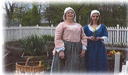
Our Docents pictured give tours of the 4-Square Garden at the Heller Homestead.

Visit our website at www.sauconvalleyconservancy.org to volunteer or make a donation. Email us at info@sauconvalleyconservancy.org to tell us how you'd like to be involved. We can't wait to welcome you!